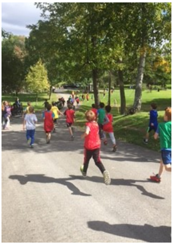
Help kids enjoy their way to a healthier lifestyle! One hour of physical activity every day: at home, at school, at play. Every step counts!

These events prove the importance the students, parents, teachers and volunteers place on promoting a healthy active lifestyle .